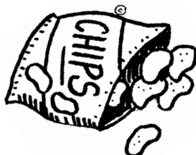
Bag of chips