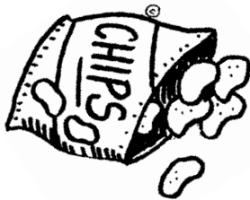
Bag of chips