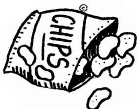
Bag of chips