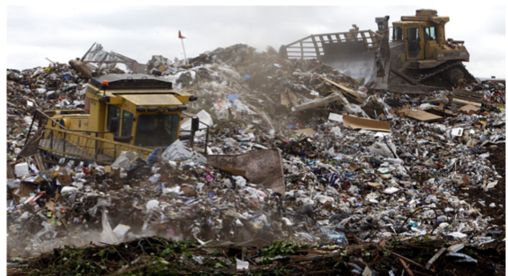
Puente Hills Landfill (Los Angeles)